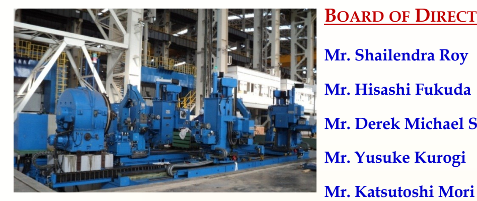
Side Entry Groove Machine