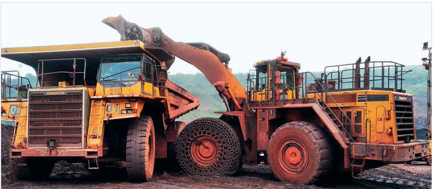
Komatsu WA900 Wheel Loader loading HD785 Dump Truck at TSL-Noamundi Mines.

In TSL sites, Safety is the key deliverable for each activity with focus on SOP. With L&T's track record of zero accident, TSL had awarded four-star rating in 2019 to L&T for continuous efforts and adherence of CSM standard in all OMQ mines. L&T works jointly with TSL to establish Noamundi