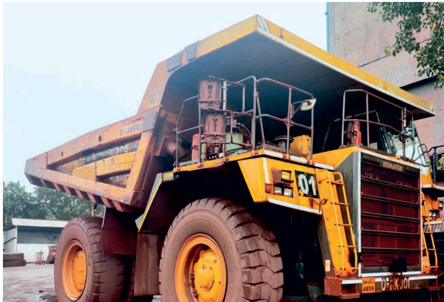
Komatsu HD785 – the star machine which created ripples in the iron ore industry with its impeccable performance!