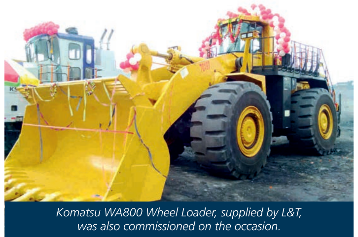
Komatsu WA800 Wheel Loader, supplied by L&T, was also commissioned on the occasion.

Besides sizeable and growing installation base in Indian mines, L&T Surface Miners are making strong inroads in international markets with exports to Gulf and African countries across various mineral applications.