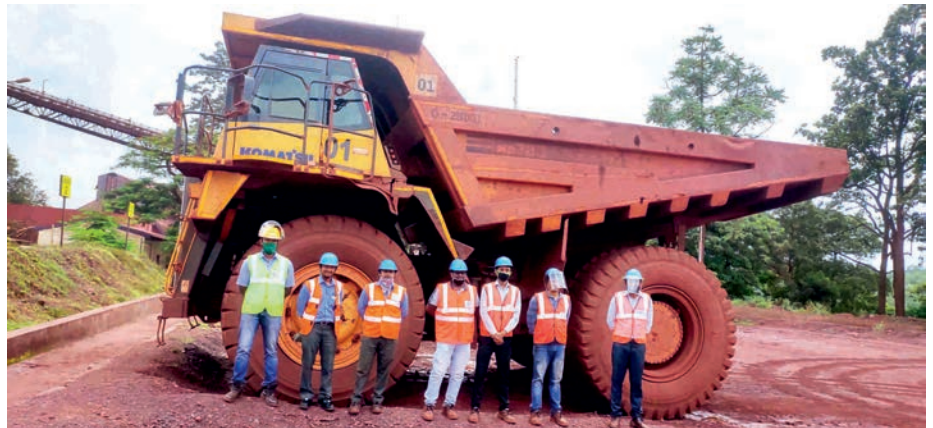
L&T-Durgapur team, which extended product support at site

As part of women's empowerment, Tata Steel has initiated 'Team- Agranee' as HEMM maintenance crew for the first time in mining history. Six girls with ITI qualification have been recruited by L&T and given extensive training in their Service Centre in Durgapur. They will be inducted soon in the OMQ Division, to take up maintenance activities.