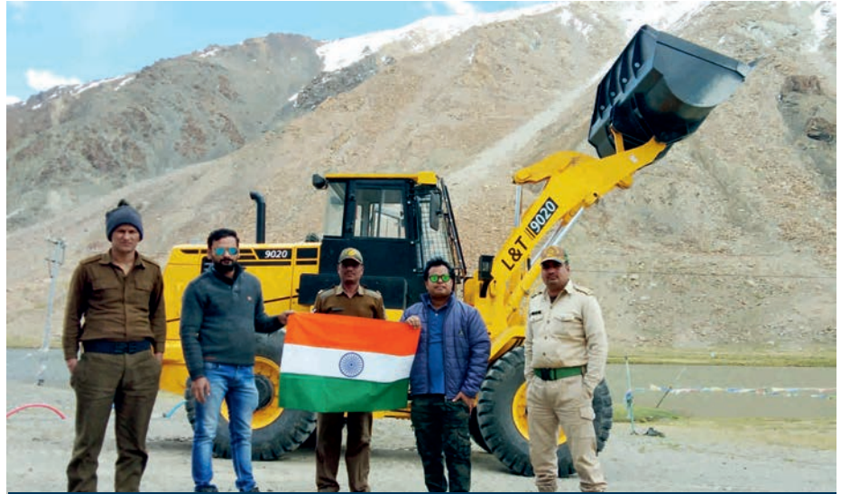
L&T team proudly waves the Indian Tricolour at the commissioning site of L&T 9020 Wheel Loader in Ladakh.

BRO projects are toughest in terms of the terrain, altitude, hostile climate and the remoteness of the sites. This is L&T's first foray into BRO for Wheel Loaders and will extend the after-sales support through its Dealers. L&T is proud to be associated with BRO and Indian Army, and in their efforts to build a solid defence against incursions across the border.