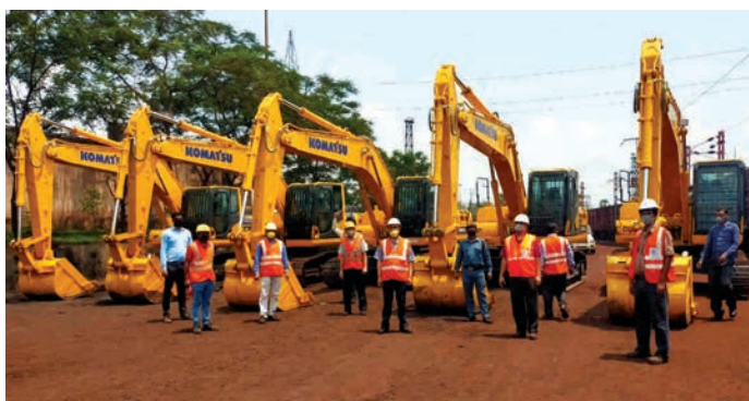
Handing over of Komatsu PC210-10M0 machines at NKCL site near Kolkata.