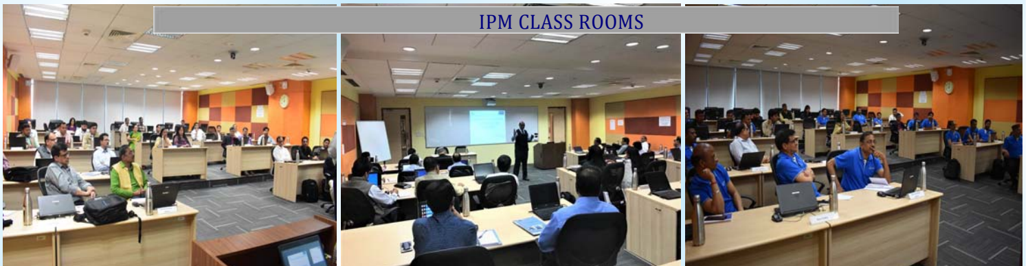
IPM CLASS ROOMS