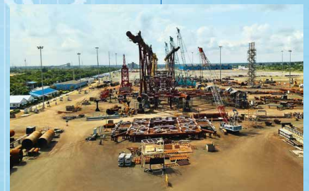
Kattupalli, India 600,000 m 2 area (Available: an additional 1,000,000 m 2 )