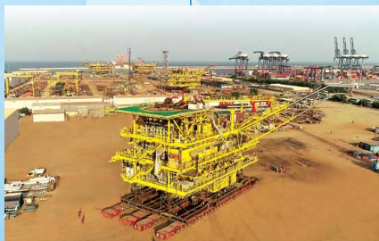
Sohar, Oman 700,000 m 2 area

Each facility is designed for the fabrication of complex process modules and long pipe rack trains, shippable in transportable sizes, duly match-marked for smooth Installation at the construction site.