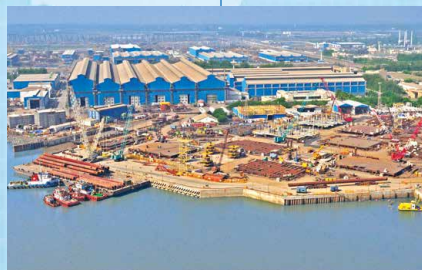
Hazira, India 500,000 m 2 area