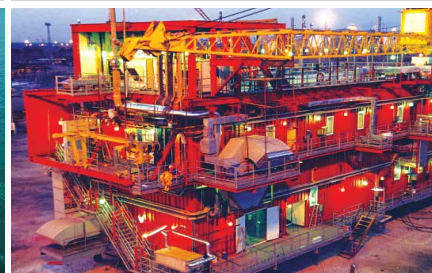
Living Quarter Modules & E-Houses