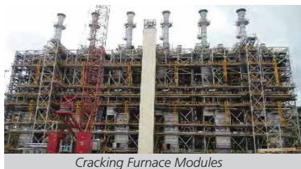
Cracking Furnace Modules