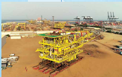
Sohar, Oman 700,000 m 2 area

Each facility is designed for the fabrication of complex process modules and long pipe rack trains, shippable in transportable sizes, duly match-marked for smooth Installation at the construction site.