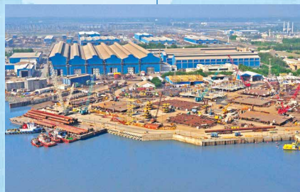
Hazira, India 500,000 m 2 area