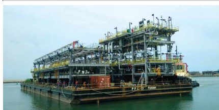
Pre-Assembled Manifold / Pipe Rack Modules