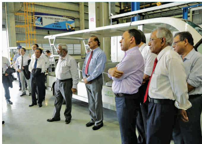
Dignitaries seen inside the new shopfloor