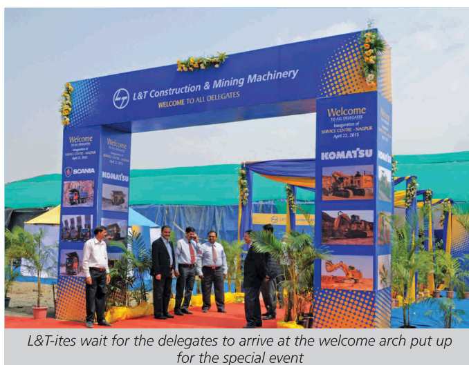
L&T-ites wait for the delegates to arrive at the welcome arch put up for the special event

Madhya Pradesh. The other Service Centres established by L&T are located at Kanchipuram (South), Pune (West), Bahadurgarh (North) and Durgapur (East).