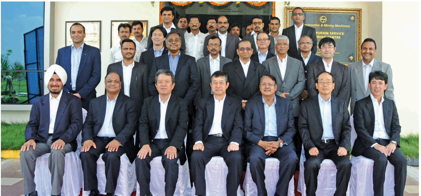
Group photo of L&T team with Komatsu delegation taken during the visit at Kanchipuram.