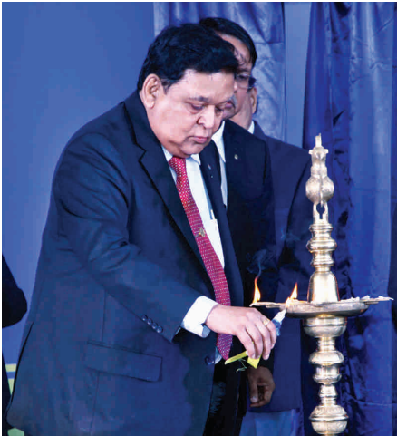
Mr. A.M.Naik, Chairman, L&T lighting the lamp to mark the beginning of the event.