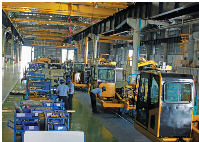
Komatsu's new manufacturing line for Hydraulic Excavators

Komatsu believes that India is one of the leading markets with promising growth in the mid to long-term for Construction Equipment and regards its business in India with a long-range perspective. Komatsu positions this new factory as a core manufacturing site to deliver high-quality products to customers not only in India, but to the Middle East and Africa in the future. With this new factory, Komatsu plans to build more flexible global production and supply operations and sharpen its global competitiveness.