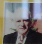
Shri Anil Razdan Former Secretary Power & Formerly Sp. Secretary, Petroleum & Natural Gas Government of India