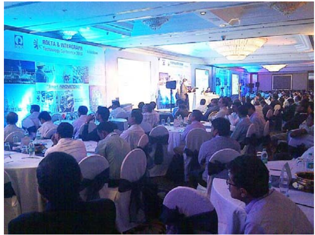
Rolta & Intergraph Technology Conference 2013

L&T Hydrocarbon Engineering won the prestigious Intergraph Golden Valve INDIA Award 2013 at the Rolta & Intergraph Technology Conference 2013, in December 2013 for its Engineering Centre in Mumbai. The award was conferred for Photo-Realism. The Mirror-Like Reflection image of the Cooling Tower area of GNFC, Bharuch Project, which was created through PDS and SPR Intergraph software won laurels in the category.